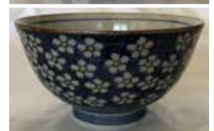
Blue Bowl with White Flowers, M #SSY-4566 Porcelain *Perfect Size for Ozoni Soup 2.75"H, 5.25"Dia. $8.95 each