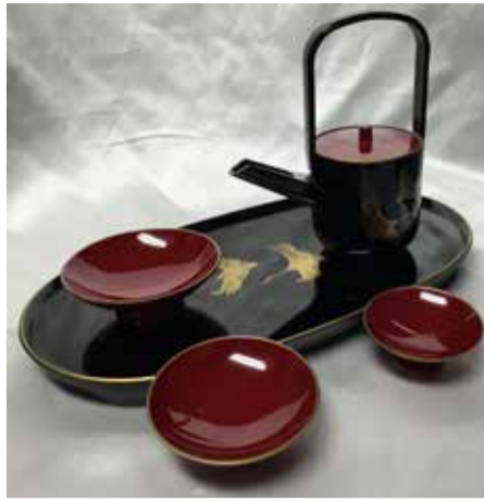
New Year Sake Otoso Set Lacquer Tsuru Design #TS-852 Small $47.95 #32-5911 Large $89.00