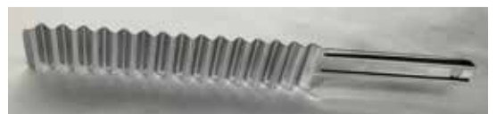
Stainless Steel Kanten or Yokan Cutter 7" Long, 1" Wide $18.50