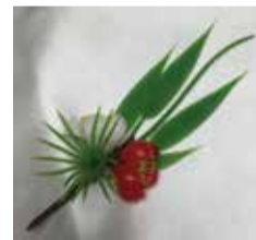
Sho-Chiku-Bai Twig Plastic 3.5"L, 3"W 59 cents each