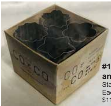
#134 Ume, Sakura, Five-Pointed Star and Chrysanthemum (4-1) Stainless Steel. Each: 1.75"H, 0.88"W $11.20 per set