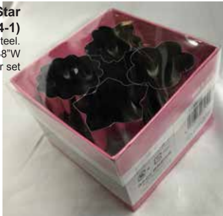
#132 Ume, Sakura, Five-Pointed Star and Chrysanthemum (4-1) Stainless Steel. Each: 2.25"H, 1.38"W $15.95 per set