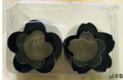
Ume and Sakura in 2 sizes (4-1) Stainless Steel. Large: 1.25"H, 1.38"W Small: 1.25"H, 1"W $4.95 per set