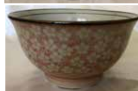
Pink Bowl with White Flowers, M #SSP-4566 Porcelain *Perfect Size for Ozoni Soup 2.75"H, 5.25"Dia. $8.95 each