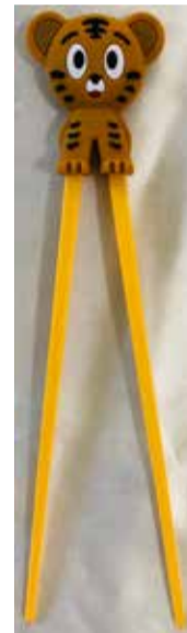
#EC12/C Tiger Design Training Chopsticks 9"L, Detachable Made in China $4.45 pair