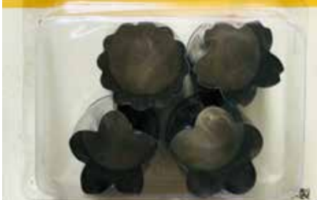
Ume, Sakura, Five-Pointed Star and Chrysanthemum (4-1) Stainless Steel. Each: 1.25"H, 1"W $4.95 per set