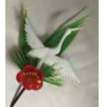
Sho-Chiku-Bai with Tsuru Plastic 3.5"L, 3"W 59 cents each