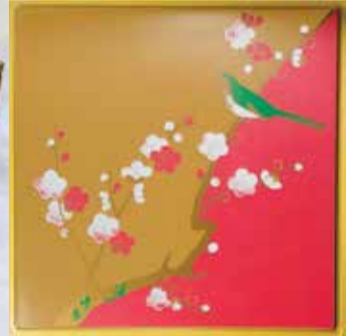
#288-130 Jubako (2-tier) Songbird and Sakura on Beige/Gold/Pink Lacquer, Black Inside 4.75"H, 7.75"x7.75" $49.75