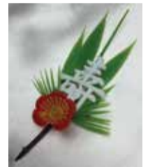
Sho-Chiku-Bai with kanji "Kotobuki" or Long Life Plastic 3.5"L, 3"W 59 cents each