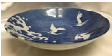
#TSN-2 Bowl 8" Dia., 1.75"H $7.49 each