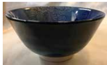
#TSN-7, 4go Tayo Bowl 5" Dia., 2.5"H $6.95 each