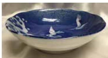
#TSN-1, 5 sun Bowl 6.5" Dia., 1.5"H $4.49 each