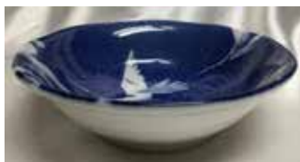
#TSN-6, 3.3 sun Dish 4.25" Dia., 1.25"H $2.95 each