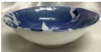
#TSN-5, 4go Bowl 5" Dia., 1.5"H $3.95 each