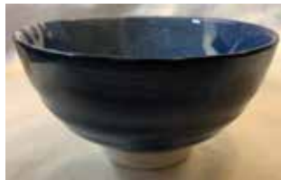
#TSN-9 Rice Bowl 4.25" Dia., 2.25"H $5.95 each