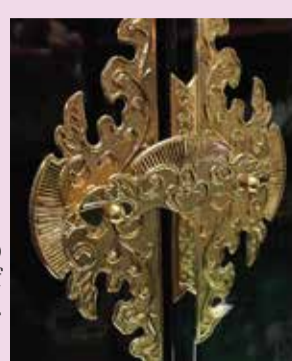
Close-up image of front lock.