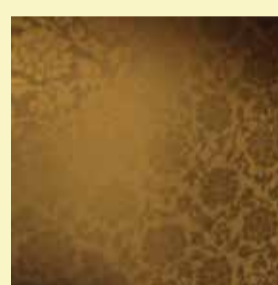
Close-up image of interior decor.