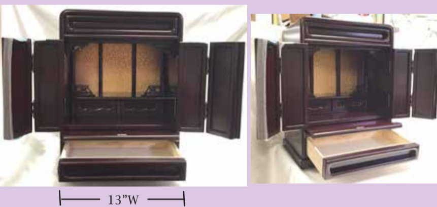
Butsudan #M-16 Pine Wood Includes 1 Extended Platform and 2 Drawers to hold accessories 19"H, Base 15.25"W, 10.75"D $695.00