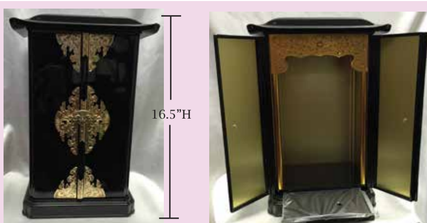
Large Zushi #A-526 Plastic with Black Lacquer Coating with Gold Trimmings. (Gold will not tarnish.) 16.5"H, Base 9.5"W, 7.5"D $775.00