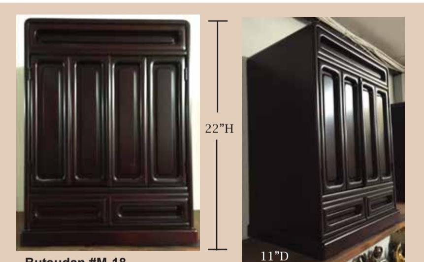
Butsudan #M-18 Pine Wood Includes 1 Extended Platform and 2 Drawers to hold accessories 22"H, Base 16.75"W, 11"D $795.00