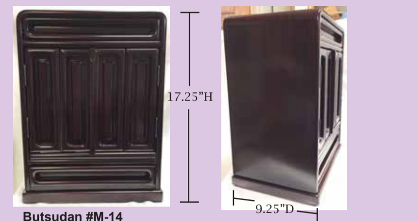
Butsudan #M-14 Pine Wood Includes 1 Extended Platform and 1 Drawer to hold accessories 17.25"H, Base 13"W, 9.25"D $546.00