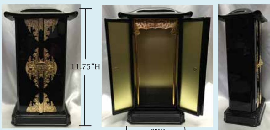
Small Zushi Plastic with Black Lacquer Coating with Gold Plastic Trimmings. (Gold will not tarnish.) 11.75"H, Base 6"W, 4.75"D $449.00 each

Phone Orders Welcome. Reach us at (808)286-9964 or iidashonolulu@gmail.com We do Shipping. Free Expert Packing.