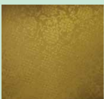
Close-up image of interior decor.