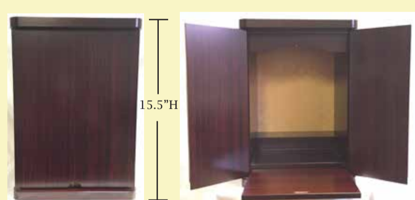
Temari #MT-14 Cherry Wood Includes 1 Extended Platform 16.5"H, Base 12"W, 9.5"D $449.00