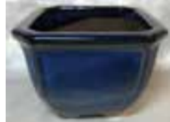
Blue Square Namako #18-24-Small 2.5"H, 3.5"L, 3.5"W $19.25