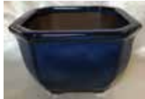
Blue Square Namako #18-24-Medium 3"H, 4.75"L, 4.75"W $38.95