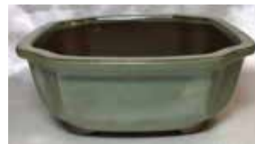
Green Mokko Oribe #19-20-Large 2.75"H, 6.5"L, 5.5"W $23.50