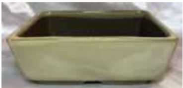
Cream Rectangle #19-15-Large 2.25"H, 6.25"L, 4.75"W $18.50