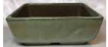
Green Rectangular Oribe #19-16-Medium 2"H, 5.5"L, 4"W $13.95