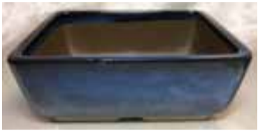
Blue Rectangular Namako #19-14-Large 2.25"H, 6.25"L, 5"W $18.50