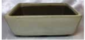
Cream Rectangle #19-15-Medium 2"H, 5.5"L, 4"W $13.95 #19-15-S 2"H, 4.5"L, 3"W $9.25