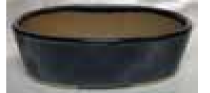
Blue Oval Namako #19-7-Small 1"H, 3.75"L, 2.5"W $6.25