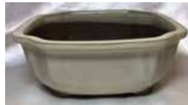
Cream Mokko #19-19-Large 2.5"H, 6.25"L, 5.5"W $23.50 #19-19-S 2.5"H, 5.5"L, 4.5"W $16.25