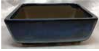
Blue Rectangular Namako #19-14-Medium 2"H, 5.5"L, 4"W $13.95 Limited Quantity:1