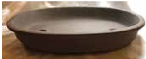
Oval Planter Udei #36-3 2"H, 12"L, 9"W $51.00