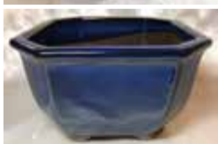
Blue Square Namako #18-24-Large 3.5"H, 5"L, 5"W $57.75