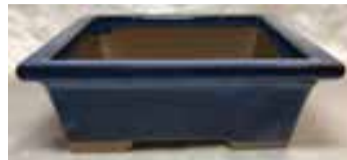
Blue Rectangular Namako #19-10-Large 2.25"H, 6"L, 5"W $20.95