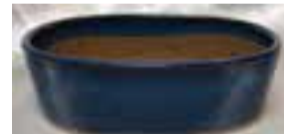
Blue Oval Namako #19-7-Medium 1.25"H, 4.5"L, 3.25"W $12.45