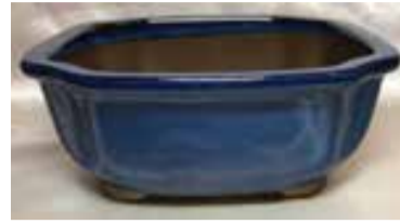
Blue Mokko Namako #19-18-Large 2.75"H, 6.5"L, 5.5"W $23.50 #19-18-Small 2.5"H, 5.75"L, 4.75"W $16.25