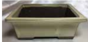
Cream Rectangle #19-11-Large 2.25"H, 6"L, 5"W $20.95 #19-11-S 2"H, 5"L, 3.5"W $10.95