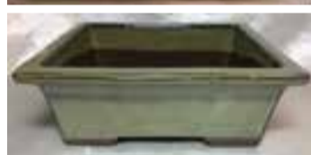
Green Rectangular Oribe #19-12-Large 2.25"H, 6"L, 5"W $20.95