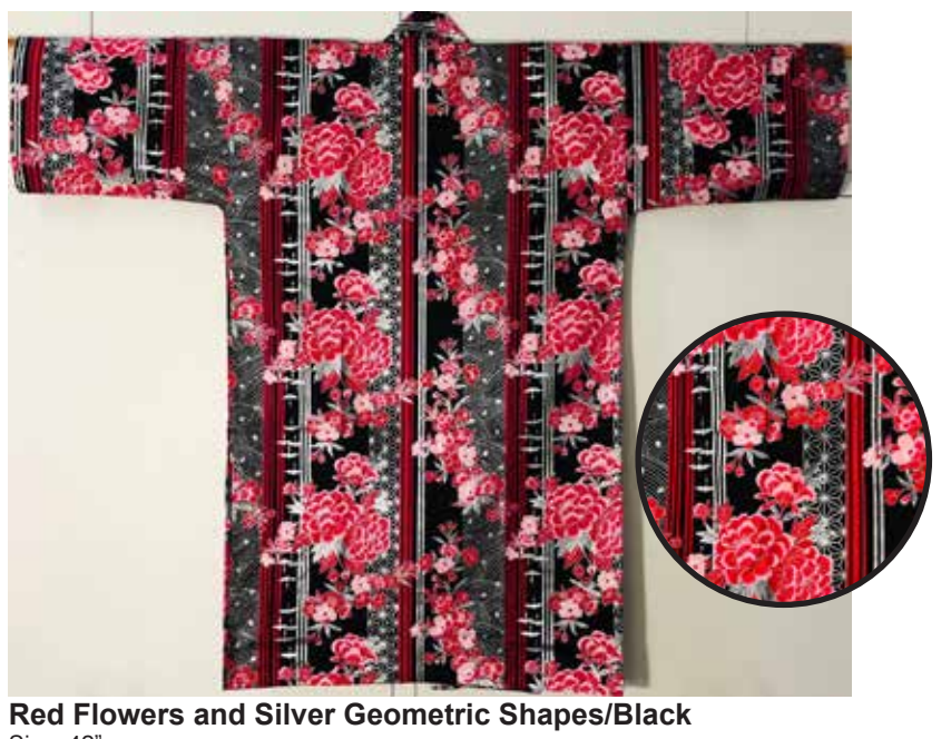
Size: 42" One Size Fits All $87.25

Phone Orders Welcome. Reach us at (808)286.9964 or iidashonolulu@gmail.com We do Shipping. Free Expert Packing. Prices Subject to Change.