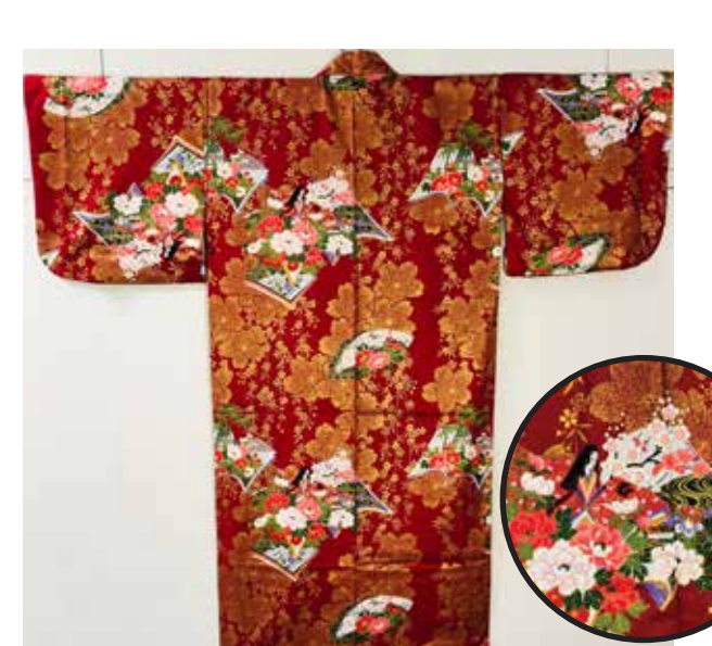
#587 O-hime-sama, Fans and Gold Flowers/Red