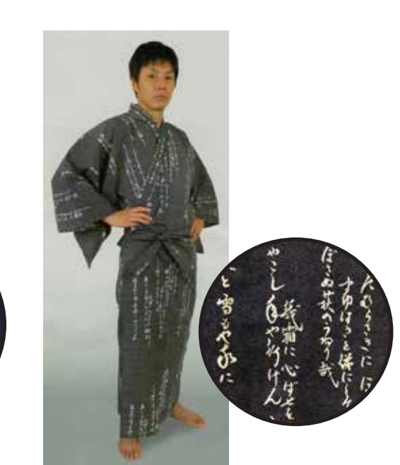
#YB-471 Love Notes Size: EXL 64" Size: L 61" 5ft9"-6ft1" 6ft1"-