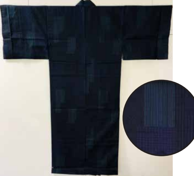
#YB-1572B Geometric/Dark Blue Size: L 61" 5ft9"-6ft1"