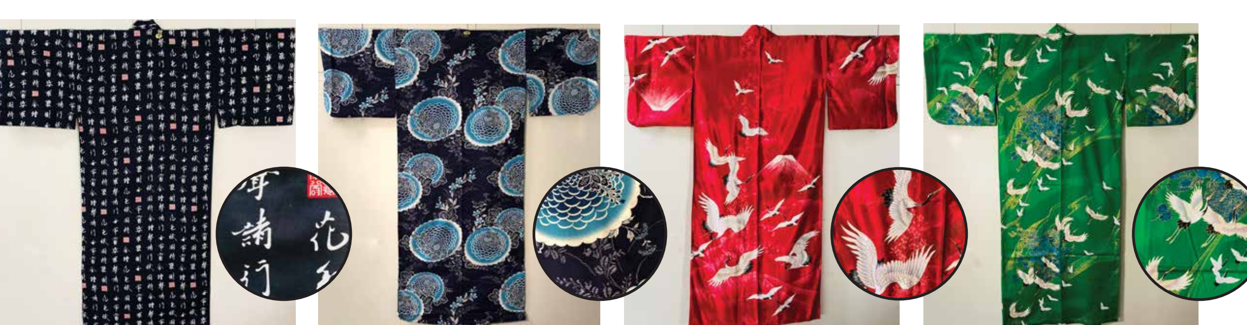
Chinese Characters (Flowers, Color, etc.)/Dark Blue