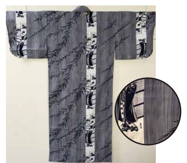
#YKO-542 Geisha/Dark Blue