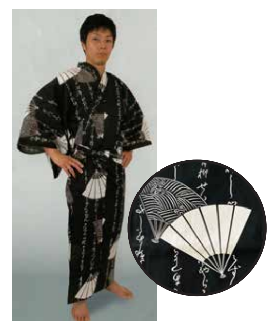
#YB-375 Fans/Black Size: M 58" Size: L 61"