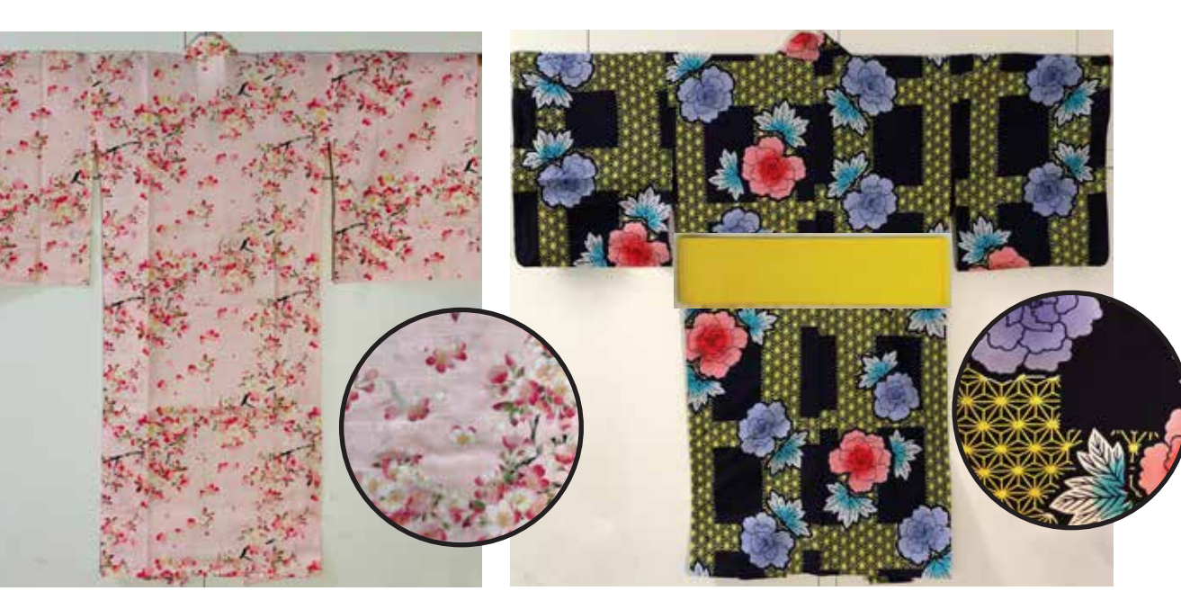
#ZSM (YT-104-45) Includes bright yellow belt Size: 50" 4ft6"-5ft0" Size: 45" 4ft1"-4ft5"

YB-1553-A Pink Sakura Size: L 58" $168.00