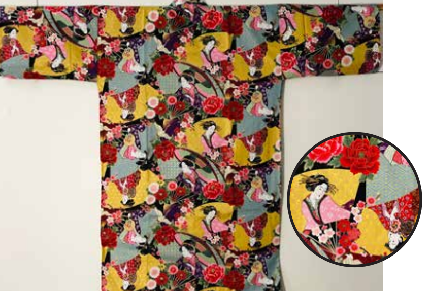
Geisha and Red Flowers/Gold Size: 42" One Size Fits All