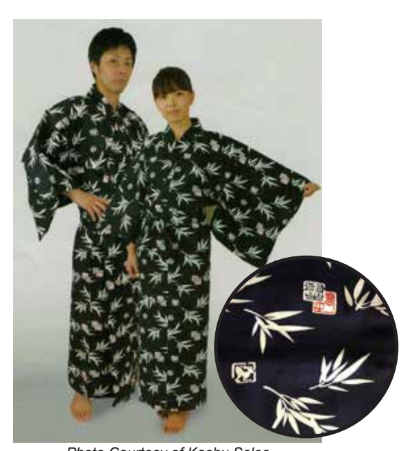
#YB-481 White Bamboo Leaves/Dark Blue Size: L 61" Size: EXL 64" 5ft9"-6ft1" O/S $130.50

All Yukatas are 100% Cotton Belt is Inside Sleeves. Machine or Hand Wash Separately. Cold or Warm, No Bleach. *All Designs and Sizes May Not Be Available. Call or e-mail to inquire.