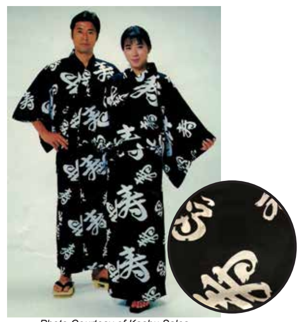
#YB-445 "Kotobuki" Longevity and "Fuku" Prosperity Kanji Characters/Black Size: M 58" Size: EXL 64"