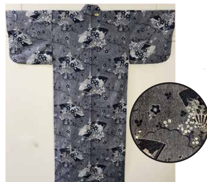
#YKO-529 Flowers and Fans/Dark Blue Size M 56" Size: L 58" 5ft5"-5ft7" 5ft9"-6ft1"