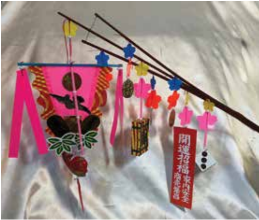
Medium Kane No Naruki New Year Money Tree for Good Luck For Indoor Display $27.50