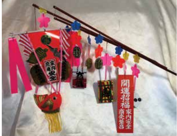
Large Kane No Naruki New Year Money Tree for Good Luck For Indoor Display $34.95