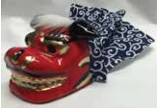
Shishi-Mailion Paper Mache/Fabric Lion Head: 2.5"H, 3.25"W $7.95