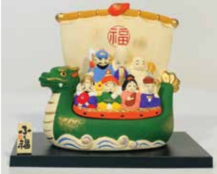
#Y135 Takarafune with 7 Gods Dragonboat: 5.5"H, 5.25"W $80.60