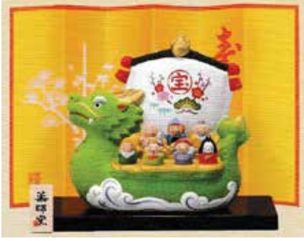
#Y64 Takarafune Gold Screen: 5.5"H Dragonboat: 4.5"H, 4.5"W $100.50