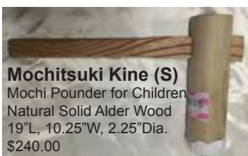
Mochitsuki Kine (S) Mochi Pounder for Children Natural Solid Alder Wood 19"L, 10.25"W, 2.25"Dia. $240.00