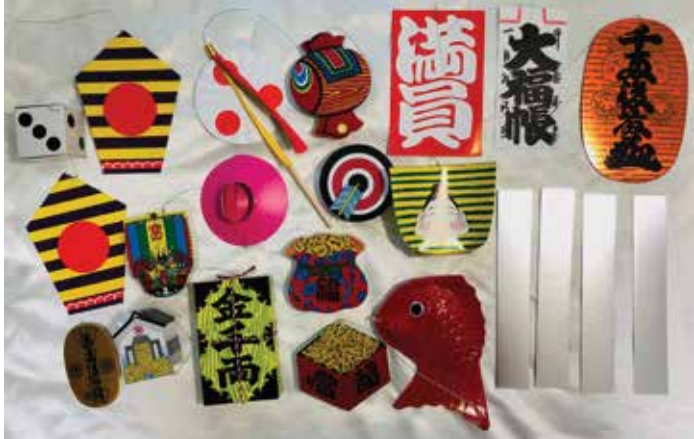
Yanagizuru New Year Decor (S) $43.25 per box