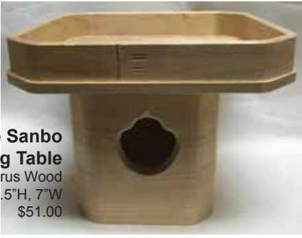
Large Sanbo Offering Table Cyprus Wood 5.5"H, 7"W $51.00