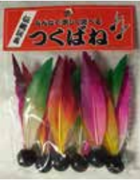
Bag of 6 Shuttlecocks for Hagoita (6-1) $11.95 per package.

Hagoita: Paddles used to play Hanetsuki Made of Cypress Wood. 3 Different Designs Available. Each paddle includes 2 shuttlecocks. 14.5"L, 4"W $33.49/Paddle