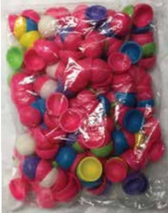
Mochibana, Mochi Flower To decorate on willow trees. Symbolizes the coming of spring in Japan. $30.75 per bag