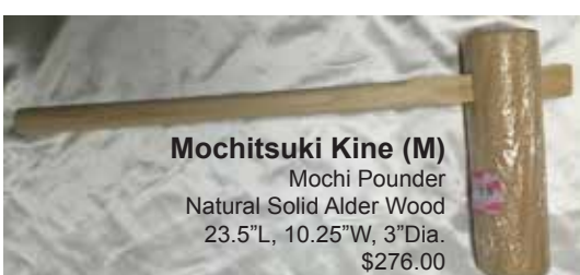
Mochitsuki Kine (M) Mochi Pounder Natural Solid Alder Wood 23.5"L, 10.25"W, 3"Dia. $276.00