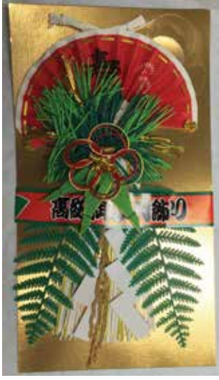
Mochi Kazari $16.20