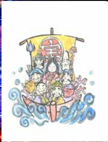
"Shichi-fuku-jin" Seven Gods of Luck on a Treasure Ship 55 cents