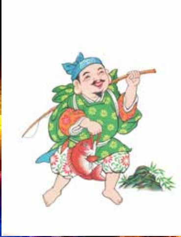
"Ebisu" Patron of Fishermen 55 cents