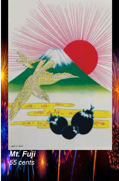
Mt. Fuji 55 cents