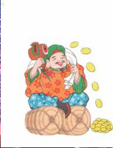
"Daikoku" God of Wealth and Agriculture 55 cents