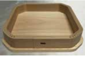
Small Sanbo, or Offering Tray Cyprus Wood 1"H, 4.5"W $13.25