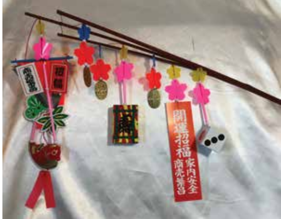
Small Kane No Naruki New Year Money Tree for Good Luck For Indoor Display $22.25