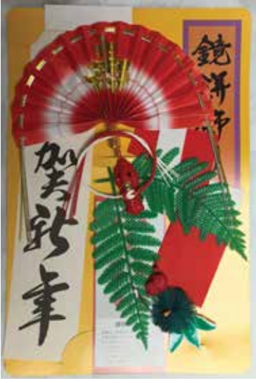
Mochi Kazari $12.80