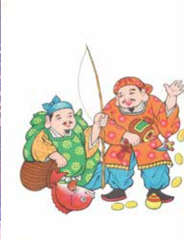
"Ebisu" and "Daikoku" 55 cents