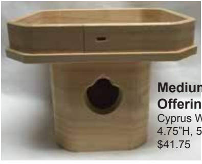
Medium Sanbo, Offering Table Cyprus Wood 4.75"H, 5.75"W $41.75