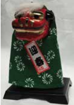
Standing Shishi Lion Paper Mache/Fabric with Plastic Stand 4.75"H, 3.5"W $7.95