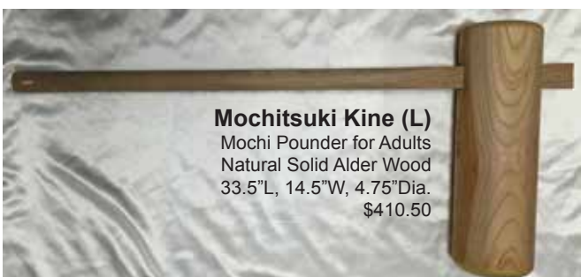
Mochitsuki Kine (L) Mochi Pounder for Adults Natural Solid Alder Wood 33.5"L, 14.5"W, 4.75"Dia. $410.50