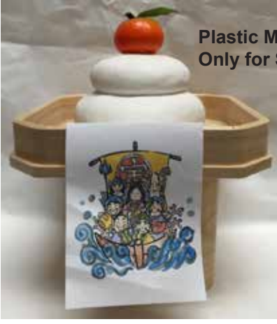
Plastic Mochi and Tangerine Not Available. Only for Store Display.