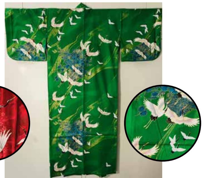
#587 Flying Cranes and Green Flowers/Green Size: 55" 5ft1"-5ft6" $128.50