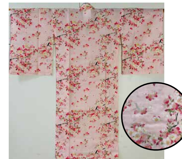
YTC-160-L #1553-A Pink Sakura Size: 45" 4ft3"-4ft7" (Ages 8-9) $108.30