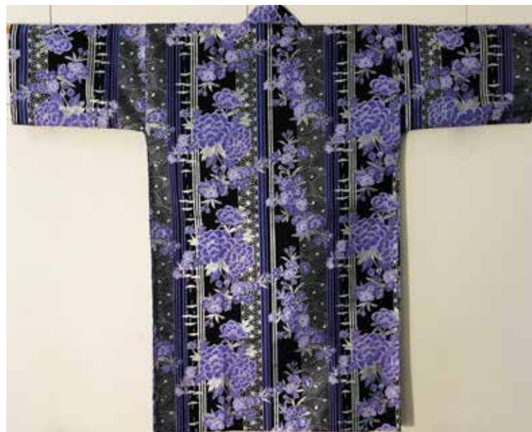
Purple Flowers and Silver Geometric Shapes/Black Size: 42" One Size Fits All $87.25