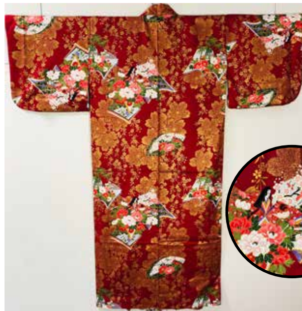
#587 O-hime-sama, Fans and Gold Flowers/Red Size: 55" 5ft1"-5ft6" $132.25