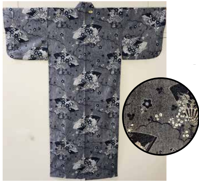
#YKO-529 Flowers and Fans/Dark Blue Size M 56" Size: L 58" 5ft5"-5ft7" 5ft9"-6ft1" $164.00 $193.00