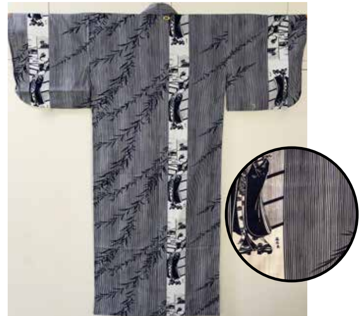
#YKO-542 Geisha/Dark Blue Size: M 56" 5ft5"-5ft7" $127.50