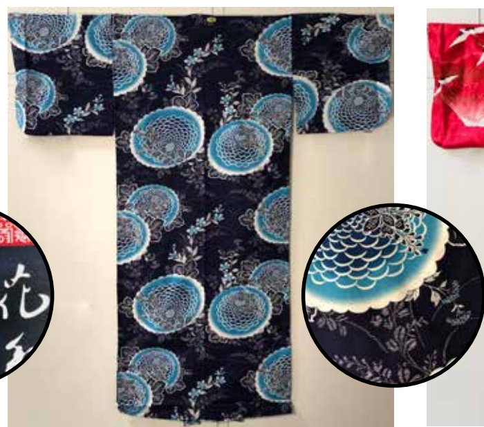
#526 Blue Tsubaki and Leaves/Black Size: L 58" 5ft.5"-5ft8" $104.75