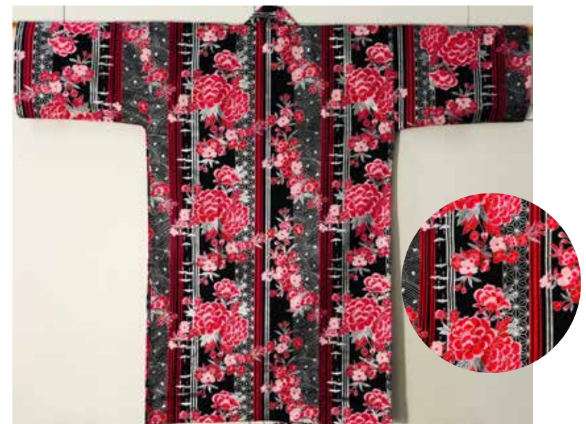
Red Flowers and Silver Geometric Shapes/Black Size: 42" One Size Fits All $87.25