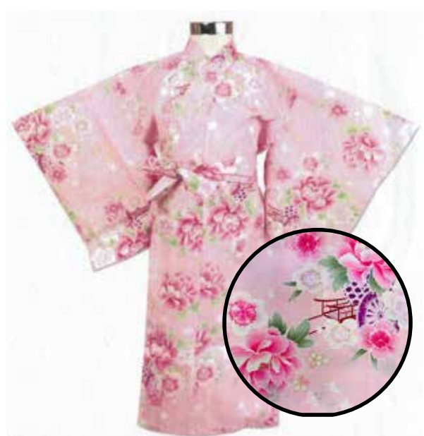
YTC-150-40 Pink Flowers Size: 40" 3ft11"-4ft.3" (For Ages 6-7) $97.45 each