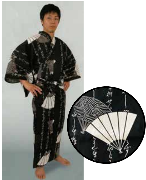
#YB-375 Fans/Black Size: M 58" Size: L 61" Size: EXL 64" 5ft5"-5ft9" 5ft9"-6ft1" 6ft1"- O/S O/S $115.55

*All Designs and Sizes May Not Be Available. Call or e-mail to inquire.