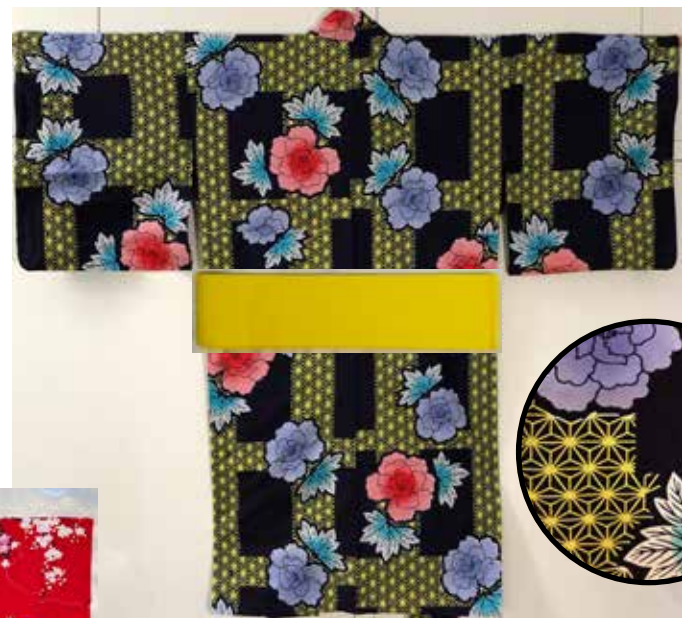
#ZSM (YT-104-45) Includes bright yellow belt Size: 45" Size: 50" 4ft1"-4ft5" 4ft6"-5ft0" $105.95 $111.95