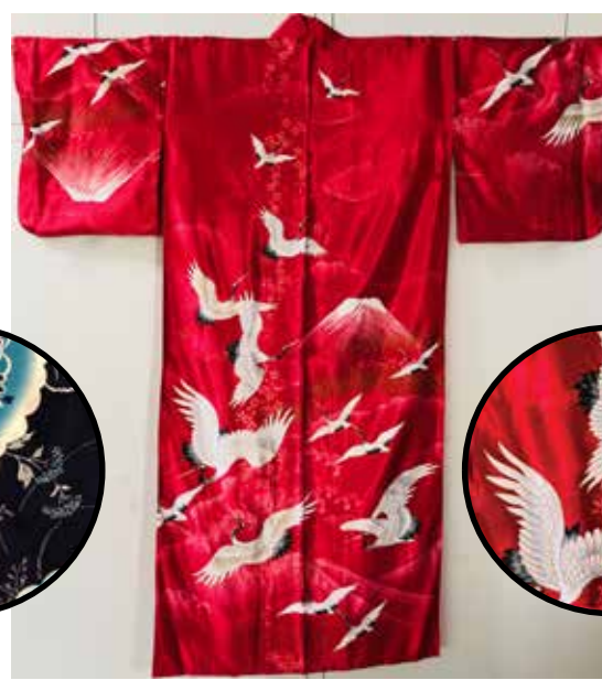
#K13 White Flying Cranes/Red 100% POLYESTER Size: M 56" 5ft5"-5ft8" $87.95