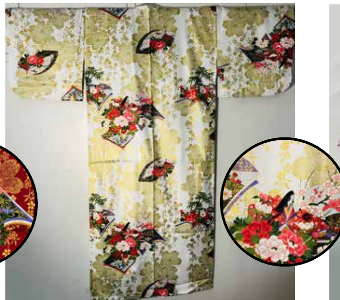
#587 O-hime-sama, Fans and Gold Flowers/White Size: 55" 5ft1"-5ft6" $132.25