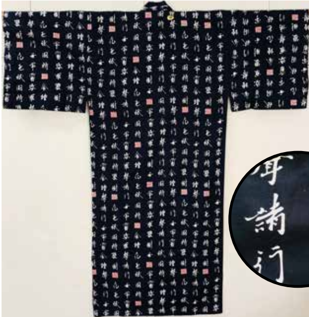
Chinese Characters (Flowers, Color, etc.)/Dark Blue Size: 56" 5ft.5"-5ft8" $135.50