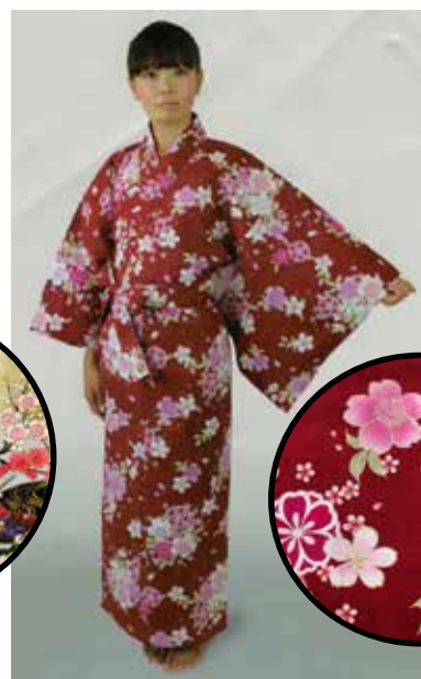
YTC-150-30 Red Flowers Size: 30" 3ft3"-3ft.7" (For Ages 2-3) $75.65 each