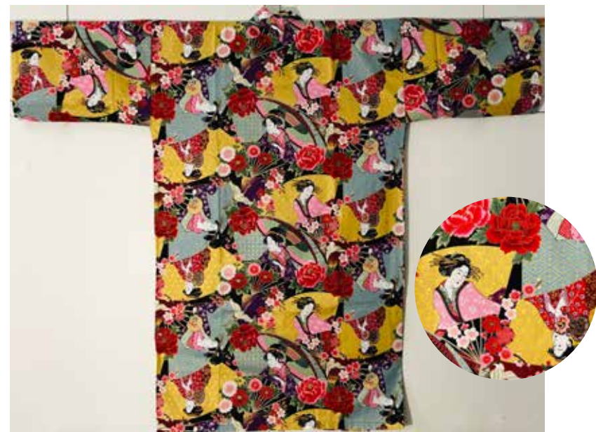
Geisha and Red Flowers/Gold Size: 42" One Size Fits All $85.75

Phone Orders Welcome. Reach us at (808)286.9964 or iidashonolulu@gmail.com We do Shipping. Free Expert Packing.