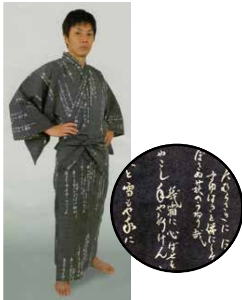
#YB-471 Love Notes Size: EXL 64" 6ft1"- $115.50