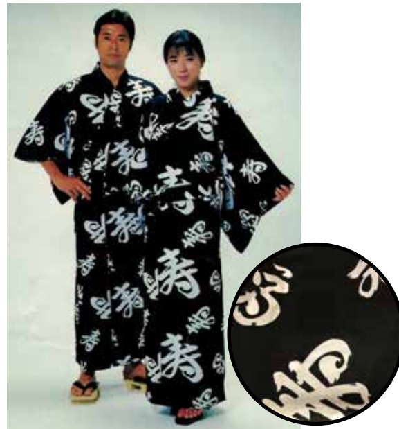
#YB-445 "Kotobuki" Longevity and "Fuku" Prosperity Kanji Characters/Black Size: M 58" Size: EXL 64" 5ft5"-5ft9" 6ft1"- $94.15 $103.00