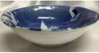
#TSN-5, 4sun Bowl 5" Dia., 1.5"H $3.95 each