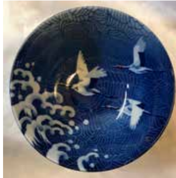
#TO-7, 4go Tayo Bowl 5" Dia., 2.5"H $8.95 each