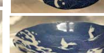
#TO-2 Bowl 8" Dia., 1.75"H $10.49 each Limited Quantity:3