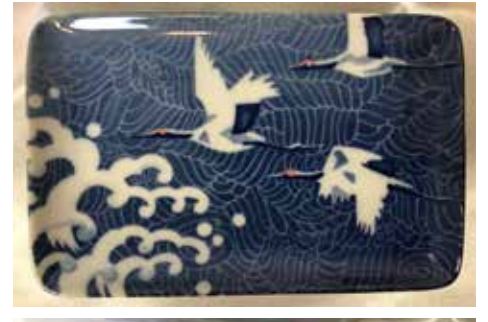
#TSN-8 Yakimono Sara "Sashimi" Plate 8" L, 5.25"W, 1"H $11.50 each