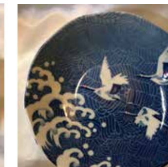
#TO-2 Bowl 8" Dia., 1.75"H $10.49 each Limited Quantity:3