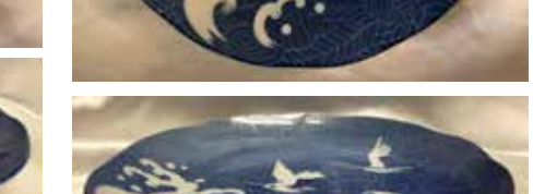
#TSN-1 Platter 10" Dia., 1.25"H $14.50

Give an "Okaeshi" or gift of appreciation to guests for occasions like birthdays, weddings, anniversaries, retirement, baby showers, graduation and funerals.