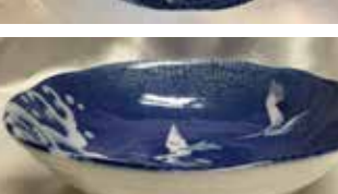
#TO-1, 5 sun Bowl 6.5" Dia., 1.5"H $6.49 each