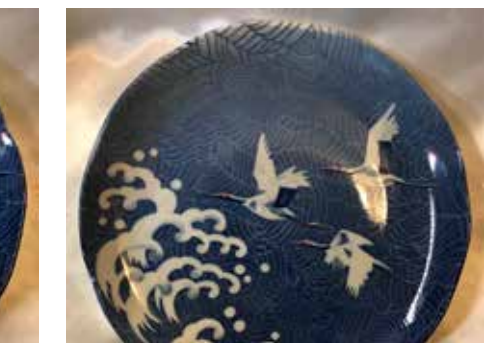
#TSN-1 Platter 10" Dia., 1.25"H $14.50