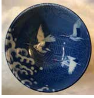
#TSN-9 Rice Bowl 4.25" Dia., 2.25"H $5.95 each