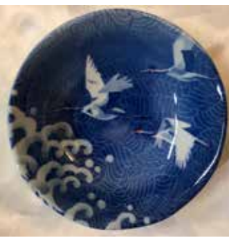
#TSN-5, 4sun Bowl 5" Dia., 1.5"H $3.95 each