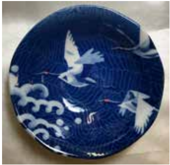
#TSN-6, 3.3 sun Dish 4.25" Dia., 1.25"H $3.50 each