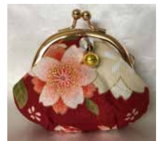
SN86 with Small Bell 3"H, 3"W, 1.25"D Rayon $16.95