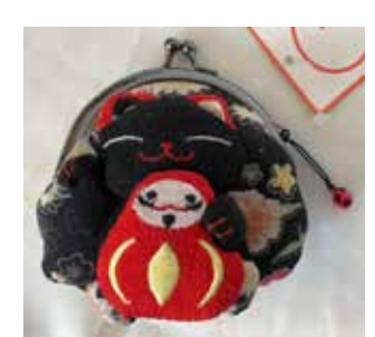
Black with small Bell 3.5"H, 3.25"W, 2"D Rayon $12.95