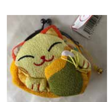
Yellow with Small Bell 3.5"H, 3.25"W, 2"D Rayon $12.95