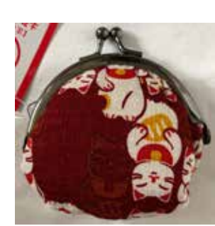
Neko Red 3"H, 3"W, 1"D Fabric $14.95