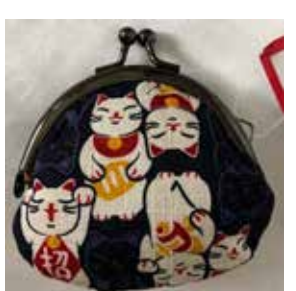
Neko Blue 3"H, 3"W, 1"D Fabric $14.95