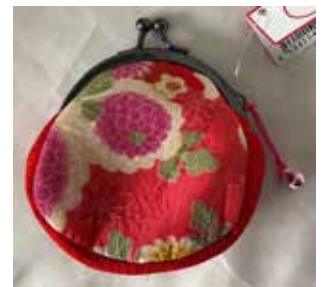
Coin Purse with Small Bell 3.5"H, 3.25"W, 1.75"D Rayon $12.95