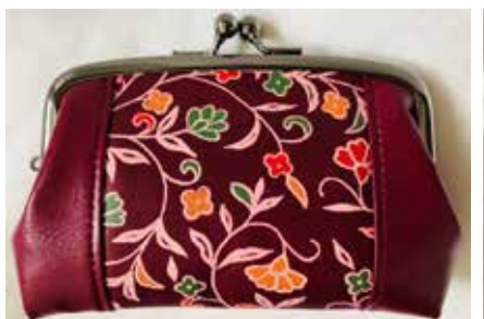
Dark Red w/ Red and Orange Flowers 4"H, 5"W, 1"D Vinyl $34.45 each