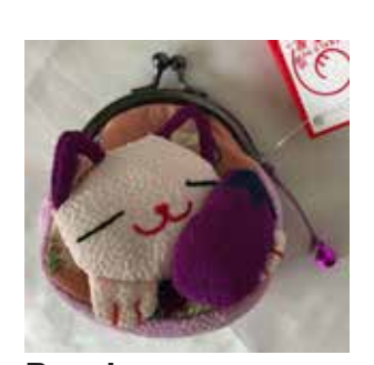
Purple with small Bell 3.5"H, 3.25"W, 2"D Rayon $12.95