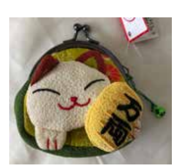
Green with Small Bell 3.5"H, 3.25"W, 2"D Rayon $12.95