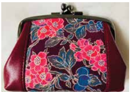
Dark Red w/ Red Flowers and Blueberries 4"H, 5"W, 1"D Vinyl $34.45 each