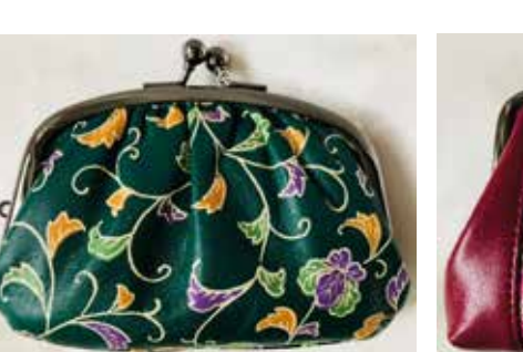
Dark Green w/ Orange and Purple Flowers 4"H, 5"W, 1"D Vinyl $34.45 each