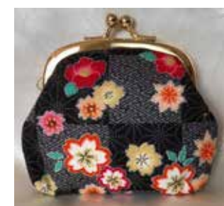
Coin Purse 3.5"H, 3.5"W, 1/2"D Rayon $14.95