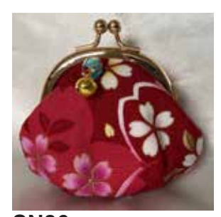
SN86 with small Bell 3"H, 3"W, 1.25"D Rayon $16.95