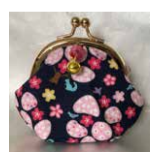
SN86 with Small Bell 3"H, 3"W, 1.25"D Rayon $16.95