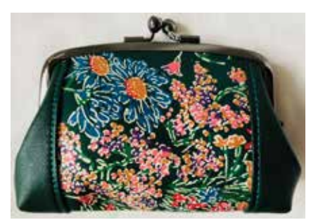
Dark Green w/ Red, Orange and Blue Flowers 4"H, 5"W, 1"D Vinyl $34.45 each