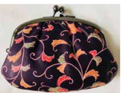
Dark Purple w/ Red and Orange Flowers 4"H, 5"W, 1"D Vinyl $34.45 each