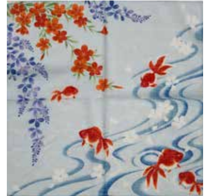
#990-Y032 Hankachi/Handkerchief Taisho Roman Kingyo Blue New! 100% Cotton. 19.5" x 20" $17.60 each