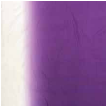
Purple to White 100% Nylon 36" x 36" $11.00 each

Phone Orders Welcome. Reach us at (808)286.9964 or iidashonolulu@gmail.com We do Shipping. Free Expert Packing. Prices Subject to Change.