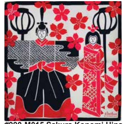
#990-M015 Sakura Konomi Hina 100% Cotton. 19.5" x 20" $17.60 each