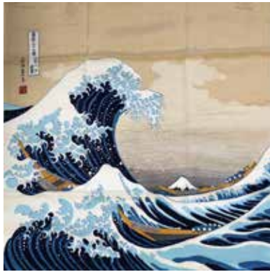
#P702 The Great Wave off Kanagawa 100% Rayon 28"L x 26.5"W $45.75