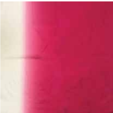
Red to White 100% Nylon 26.5" x 27.5" $9.00 each