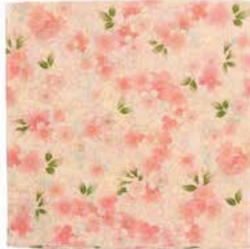
#990-S204 White/Pink Sakura 100% Cotton. 19.75" x 19.75" $13.50 each