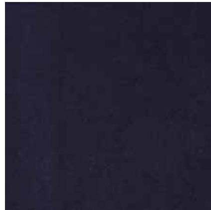
#M-3 Solid Dark Blue/Near Black (Usually to wrap urns.) 100% Cotton. 41" x 41" $35.00 each