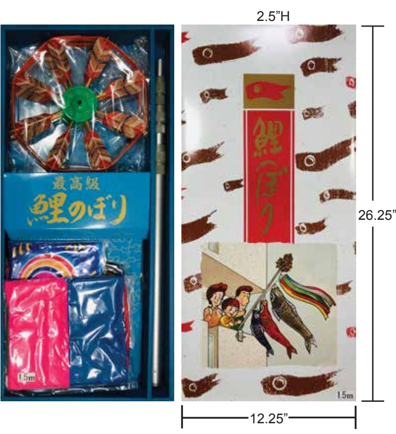
59" or 1.5 meter full set: $436.00 Nylon 39" Fukinagashi, 39" Black, 32" Red and 24" Blue Koi) Nylon 59" Fukinagashi, 59" Black, 47.25" Red and 39" Blue Koi Kazaguruma Windmill Diameter: 10" Silver Pole extends 2 yards and 4.5", Collapsed 24" USPS Postage Priority is about $40 to the mainland and about $18 to the neighbor islands.