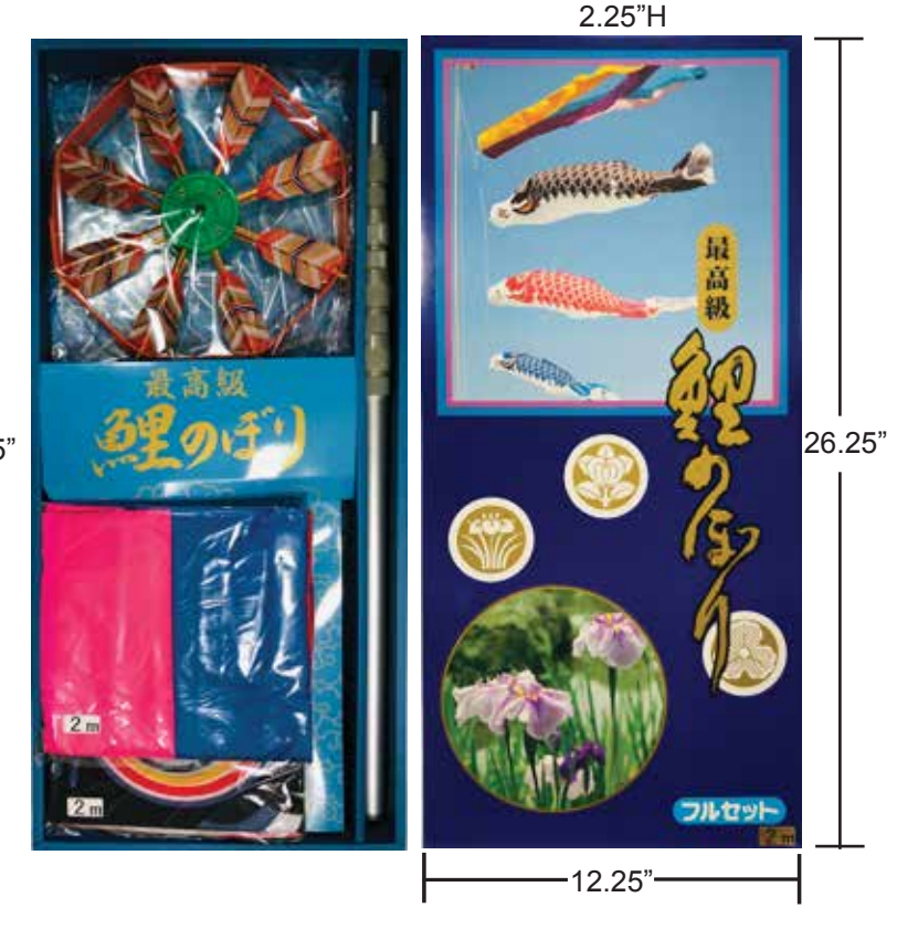
79" or 2 meter full set : $497.00 Nylon 79" Fukinagashi, 79" Black, 59" Red and 39" Blue Koi Kazaguruma Windmill Diameter: 10" Silver Pole extends 2 yards and 19", Collapsed 24" USPS Postage Priority is about $40 to the mainland and about $18 to the neighbor islands.