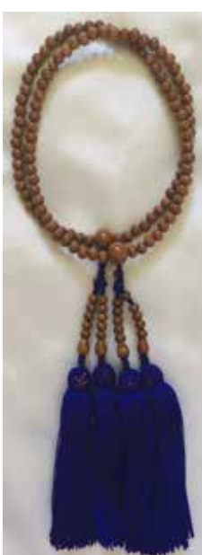
#44-3 Women's Furiwake Ume Wood with Purple Tassel. Double Strand. For any sect. 3.5"Dia. or about 22"Circum. Tassel: 3.5"L $79.00