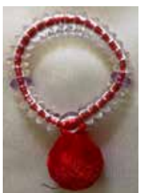
#59-3 Glass with Red Tassel. For any sect. 0.88"Dia. $5.25