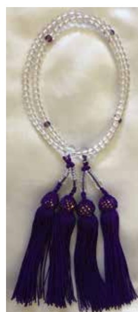
#44-5 Women's Clear Glass with Purple Tassel. Double Strand. 3"Dia. $44.95