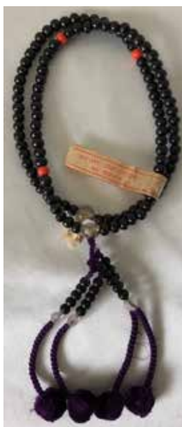
Women's with Pom Pom Black Tassel. Double Strand. For any sect. 3"Dia. or 19"Circum. Made in Occupied Japan. $55.00