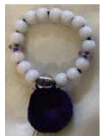
#59-2 Women's Shinwhite. For any sect. 0.88"Dia. $5.25