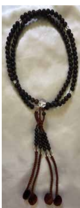
#S-1M Men's Shingon Tekkaboku with Pom Pom Brown Tassel. Double Strand. 5"Dia. or about 31"Circum. Tassel: 6"L $25.00