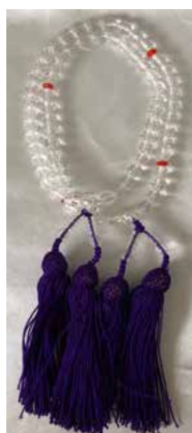
#44-5 Women's Clear Glass with Purple Tassel. Double Strand. 3"Dia. $44.95