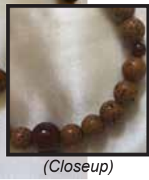
#10704524-048 Shiawase A Bo Tree. Bodhi Wood. Single Strand. 2.25"Dia. or about 7"L $139.00