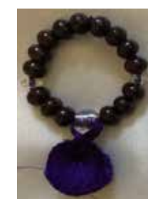
#59-7 Brown Shitan Wood. For any sect. 0.88"Dia. $5.25