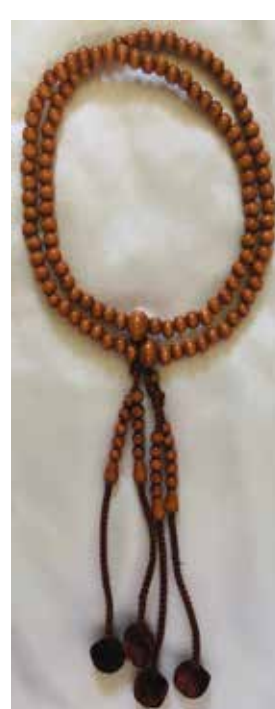
#S-2M Men's Shingon Kokuzan with Pom Pom Brown Tassel. Double Strand. 5"Dia. or about 29"Circum. Tassel: 6.25"L $25.00