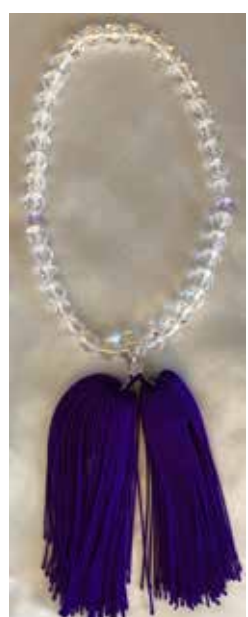
#T55B Women's Clear Glass with Purple Tassel. Single Strand. About 10"Circum. Tassel: 3"L $31.85 each