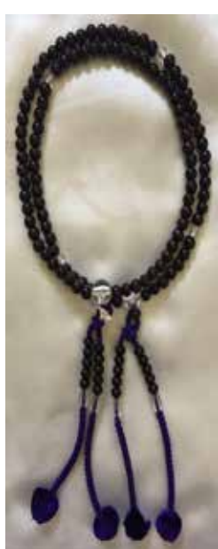
#S-1WA Women's Shingon Tekkaboku with Pom Pom Purple Tassel. Double Strand. 3.5"Dia. or about 21.5"Circum. Tassel: 3.5"L $25.00