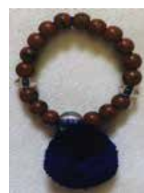
#59-5 Brown Shinseigetsu. For any sect. 0.88"Dia. $5.25