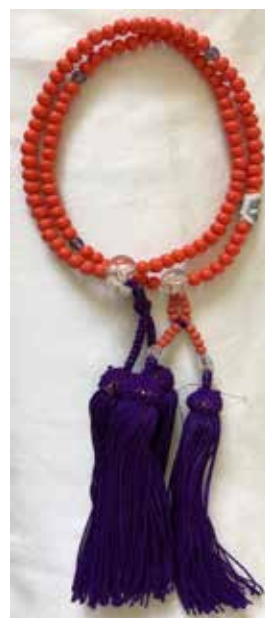
100% Genuine Red Coral with Purple Tassel. Double Strand. Made about 60 years ago 3"Dia. or about 19.5"Circum. Tassel: 3.5"L $150.00