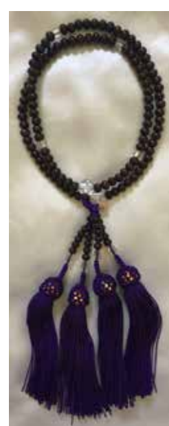
#S-1WB Women's Shingon Tekkaboku with Purple Tassel. Double Strand. 3"Dia. or about 20"L Tassel: 3.25"L $25.00