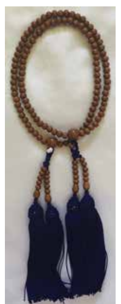
#42-3 Women's Ume Wood with Purple Tassel. Double Strand. 3.5"Dia. or about 22"Circum. Tassel: 3.5"L $67.00