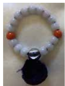
#59-2 Women's White Wango. For any sect. 0.88"Dia. $5.25