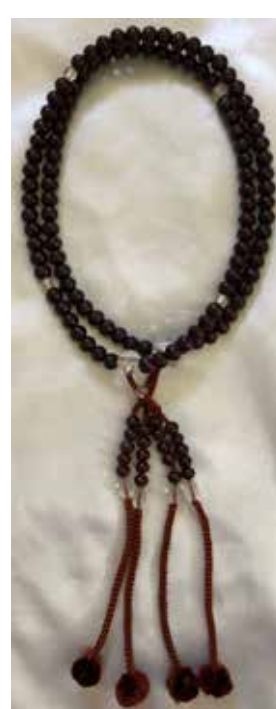
#Y-56 Men's Brown Wood with Pom Pom Brown Tassel. Double Strand. 5"Dia. or about 30.5"Circum. Tassel: 5.5"L $25.00 each