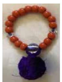
#59-1 Women's Shinsango. For any sect. 0.88"Dia. $5.25