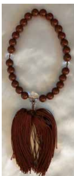
#54-2 Men's Shinseigetsu with Brown Tassel. Single Strand. For any sect. 4"Dia. or about 10"Circum. Tassel: 3"L $25.00 each

Phone Orders Welcome. Reach us at (808)286-9964 or iidashonolulu@gmail.com We do Shipping. Free Expert Packing. Prices Subject to Change.