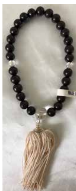
Men's with Cream Tassel. Single Strand. For any sect. 3.5"Dia. or about 10"Circum. Tassel: 3"L $25.00 each