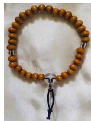
#58-1 Natural Ume Plum. Single Strand. For any sect. 2.25"Dia. or about 7"L $10.95

Phone Orders Welcome. Reach us at (808)286-9964 or iidashonolulu@gmail.com We do Shipping. Free Expert Packing. Prices Subject to Change.