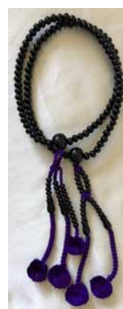
#Ni-2W Women's Nichiren Kokutan with Pom Pom Purple Tassel. Double Strand. 3.25"Dia. or about 20"Circum. $25.00