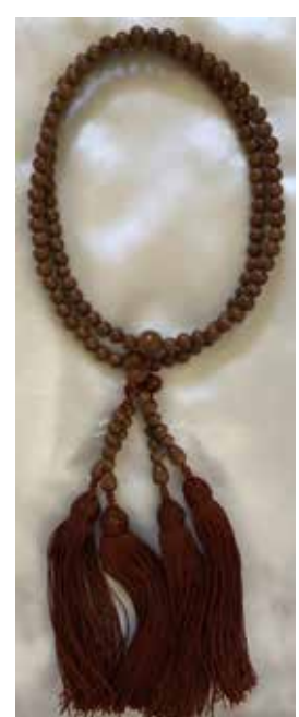
#46-1 Men's Ume Wood with Brown Tassel. Double Strand. 5"Dia. or about 32"Circum. Tassel: 4"L $89.00