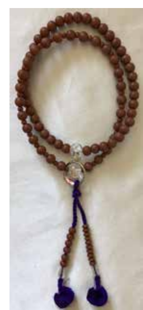
#J-4W Women's Jyodo Shinseigetsu with Pom Pom Purple Tassel. Double Strand. 3"Dia. $23.95