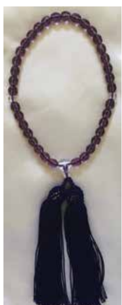
#Y-7 Women's Purple Glass with Purple Tassel. Single Strand. 3.25"Dia. or about 10"Circum. Tassel: 3.5"L $38.85 each