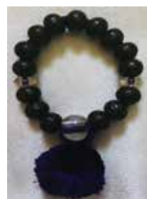
#59-8 Men's Black Seigetsu. For any sect. 0.88"Dia. $5.25

Phone Orders Welcome. Reach us at (808)286-9964 or iidashonolulu@gmail.com We do Shipping. Free Expert Packing. Prices Subject to Change.