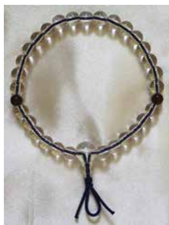
#10704523-061 Shiawase Genuine Crystal with Agate. Single Strand. 2.25"Dia. or about 7"L $134.50